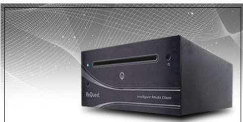
IMC Intelligent Music and Movie Client